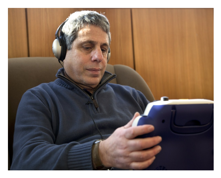
Listen to your saved books anywhere - in your favorite chair or sofa