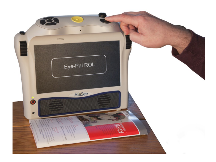
Intuitive to use - one button scan and listen